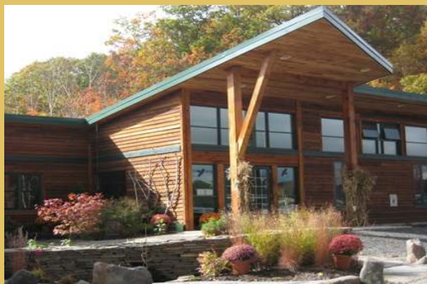
Agroforestry Resource Center 6055 Route 23 Acra, NY 12405 518.622.9820

For more information on Cornell Cooperative Extension of Columbia and Greene Counties and the programs we offer, visit our website www.ccecolumbiagreene.org . You can also “like” us on Facebook— look for Cornell Cooperative Extensions of Columbia and Greene Counties.