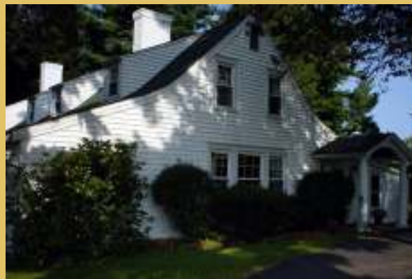
Extension Education Center 479 Route 66 Hudson, NY 12534 518.828.3346