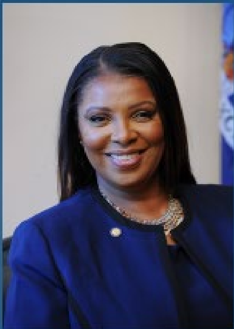
Letitia James New York State Attorney General